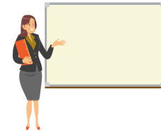
Communications and Training