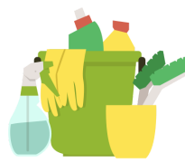
Sanitizing and Disinfecting