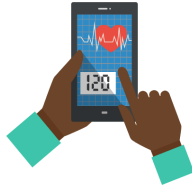
Health Screening, Testing & Preventative Hygiene